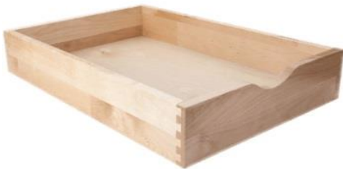
Standard Roll Out Cut Out

Standard Heights: 3" 4" 5" 6" 8" 10" 12" All bottoms are 1/2" birch plywood